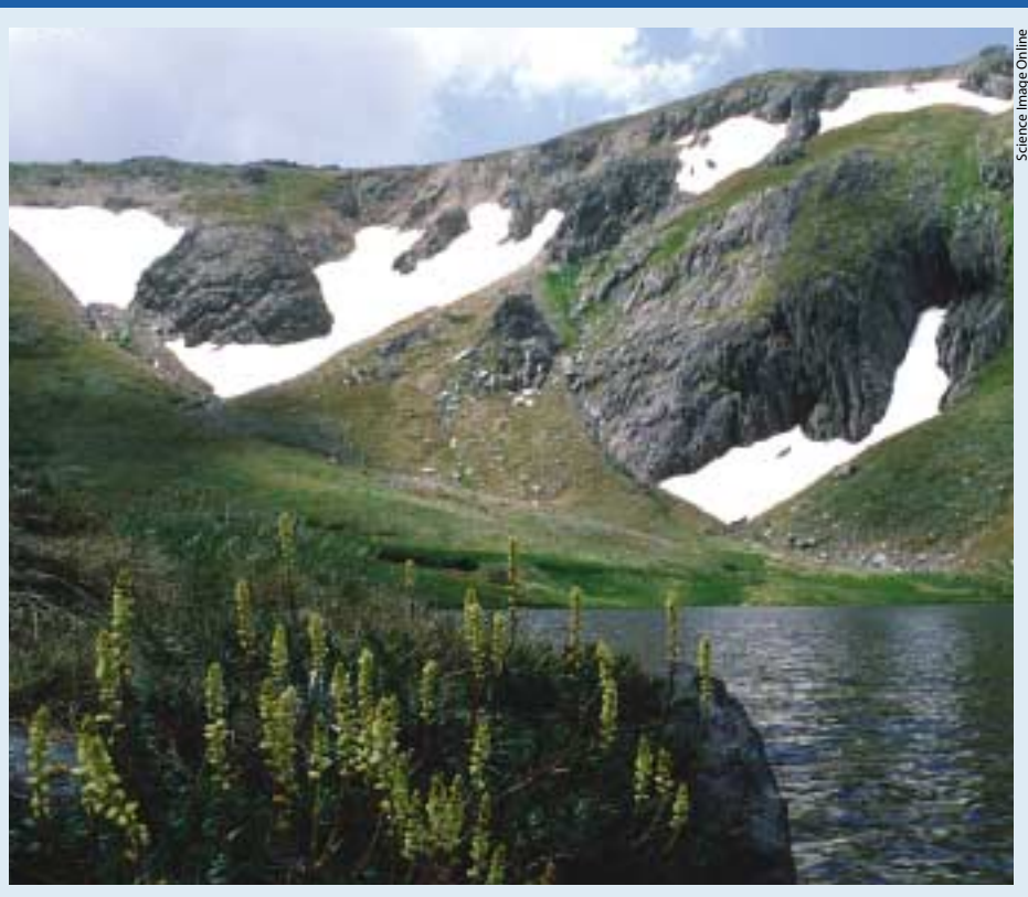
Candle Health (richea continentis) at Club Lake, Kosciuszko National Park, NSW.

The course is run from Howman's Gap Alpine Centre, near Falls Creek. Field work is held on the nearby Bogong High Plains. The course runs for one week and costs about $900. This includes all tuition and accommodation. The course covers most aspects of applied alpine ecology - soils and geomorphology, flora and fauna, numerical methods of monitoring, land use, and landscape rehabilitation. Participants undertake one-day field projects that involve data collection and analysis, interpretation of results, and presentation of the group results in a seminar format to the whole course. The benefits are varied, and an improved knowledge, contacts and interagency communication are assured. Contact: Warwick Papst at La Trobe University, (03) 94791230.